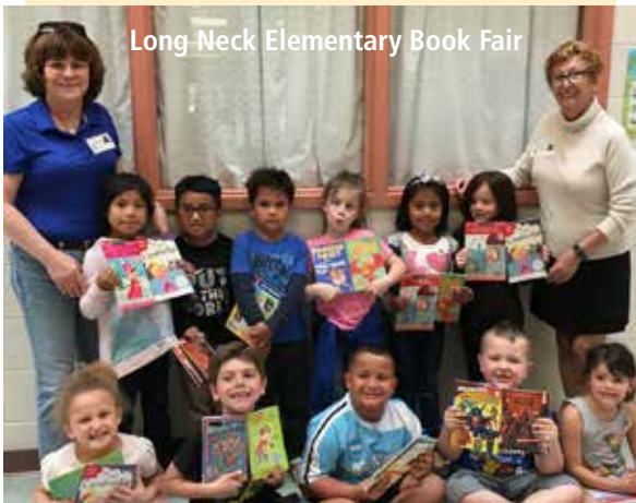
Long Neck Elementary Book Fair