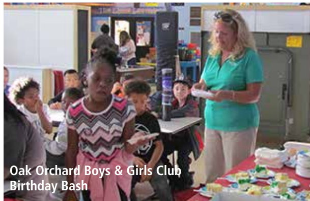
Oak Orchard Boys & Girls Club Birthday Bash