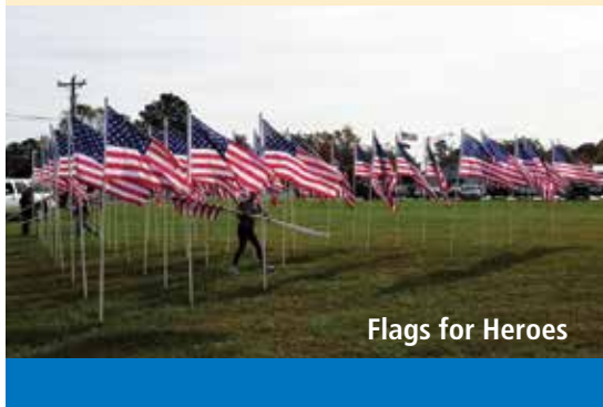
Flags for Heroes

In addition to our local efforts, we have supported international projects such as Boxes to Afghanistan, Shoe Boxes to Haiti, and Shelter Box USA. We have also participated in Rotary International grant projects to purchase for India both medical equipment for cataract surgeries and cows to establish women farmers; to develop clean, fresh water sources and 150 family sanitation facilities for Nalerigu, Ghana; and to drill wells in the Democratic Republic of Congo-Miriam's Table.