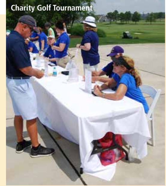
Charity Golf Tournament